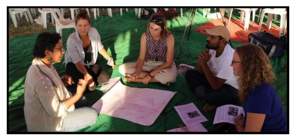
An IPEN discussion group at the IPC India global CoLab session